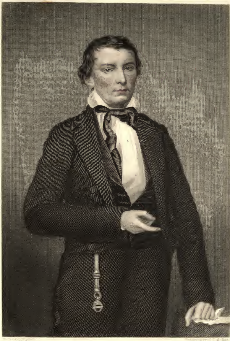
Alexander H. Stephens